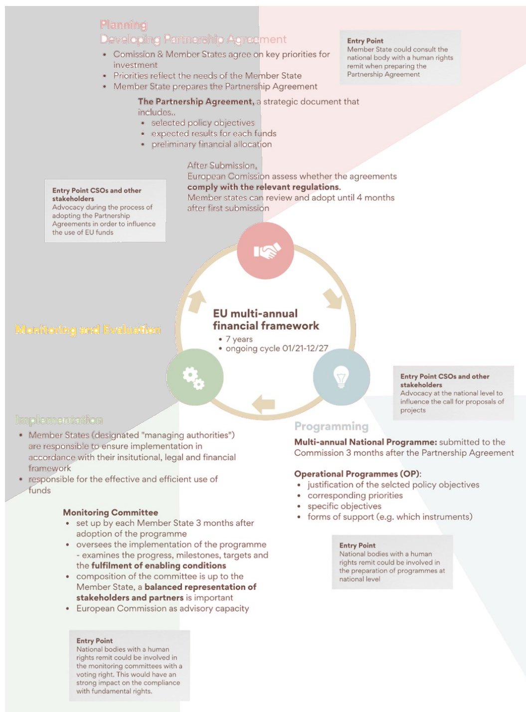
Figure 2 – Entry points for independent fundamental rights bodies in the stages of the programming period

The diagram is a graphical representation of the EU multi-annual financial framework. The potential entry points for bodies with a human rights remit or civil society organisations to consult, monitor or advocate on behalf of their mandate are during the planning, implementation and programming phases. At planning stage the entry points are when a Member State could consult with the national body with a human rights remit when preparing the Partnership Agreement and when advocacy takes place during the process of adopting the Partnership Agreements in order to influence the use of EU funds. During the implementation phase the entry point occurs when national bodies with a human rights remit could be involved in the monitoring committees with a voting right. During the programming phase the entry points occur when there is advocacy at the national level to influence the call for proposals of projects and also if national bodies with a human rights remit are involved in the preparation of programmes at national level.