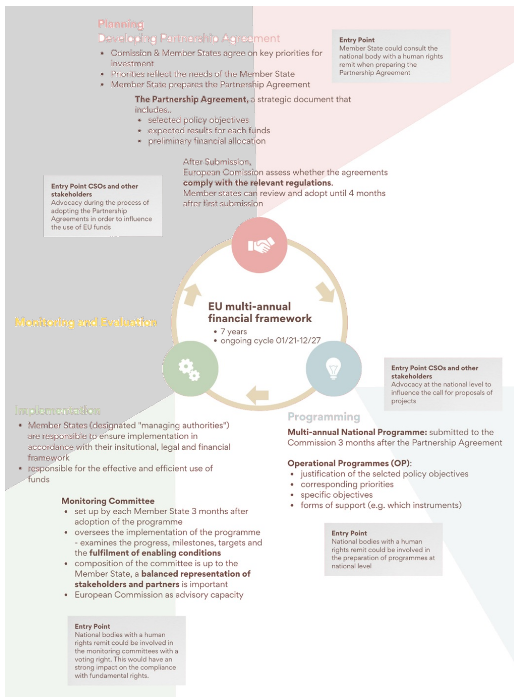
Figure 2 – Entry points for independent fundamental rights bodies in the stages of the programming period

The diagram is a graphical representation of the EU multi-annual financial framework. The potential entry points for bodies with a human rights remit or civil society organisations to consult, monitor or advocate on behalf of their mandate are during the planning, implementation and programming phases. At planning stage the entry points are when a Member State could consult with the national body with a human rights remit when preparing the Partnership Agreement and when advocacy takes place during the process of adopting the Partnership Agreements in order to influence the use of EU funds. During the implementation phase the entry point occurs when national bodies with a human rights remit could be involved in the monitoring committees with a voting right. During the programming phase the entry points occur when there is advocacy at the national level to influence the call for proposals of projects and also if national bodies with a human rights remit are involved in the preparation of programmes at national level.