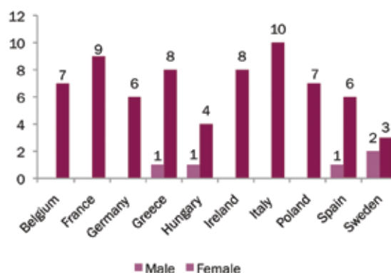
Figure A1: Number of migrants interviewed, by country and sex

findings are analysed taking into account the existing legal framework.