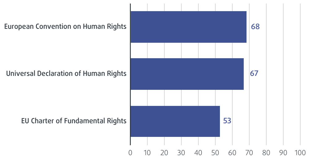
FIGURE 2.2: AWARENESS OF HUMAN RIGHTS INSTRUMENTS