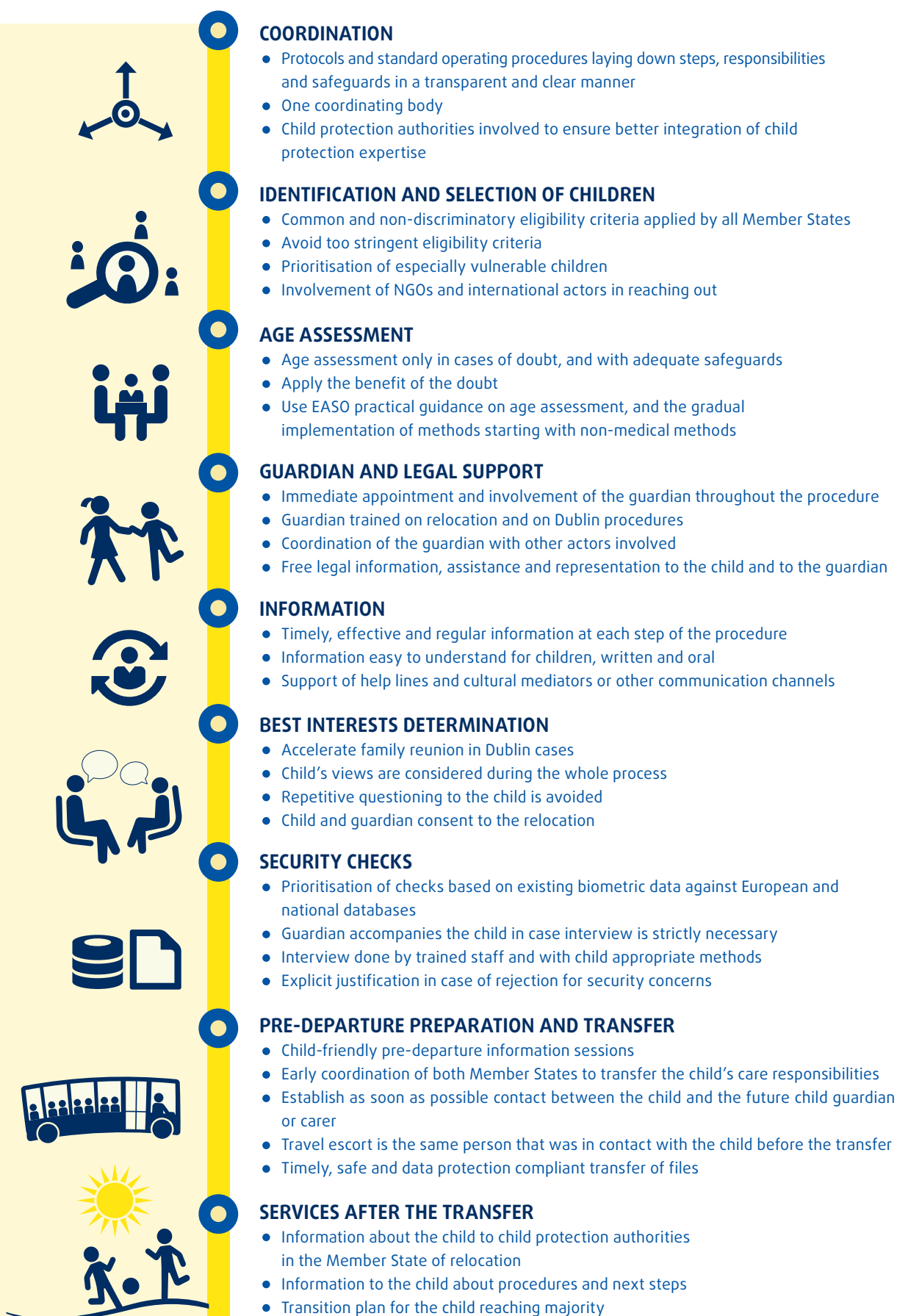
Figure 1: Relocating unaccompanied children: applying good practices to future schemes