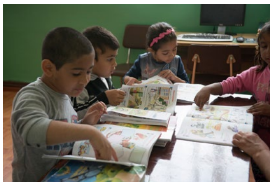
Pavlikeni – the local intervention focused on educational initiatives, including supporting participation in early childhood education

Current funding mechanisms also tend to focus on measurable outputs and outcomes to determine the success of projects and uphold accountability towards donors and financing mechanisms. Yet not all meaningful outcomes are measurable in quantitative indicators. Capturing the important impact of participatory processes and more subtle effects such as empowerment and changes in the social fabric of communities is difficult, and generally absent from project evaluations and assessments. The value of implementing participatory approaches risks being lost if not reflected in the formal project reporting mechanisms.