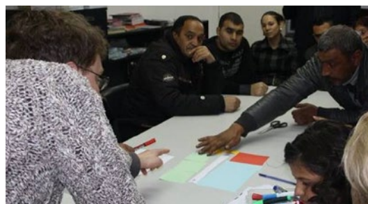
Stara Zagora – local residents from the Lozenetz neighbourhood discuss their ideal housing and floorplan of a model house at a focus group discussion in February 2016

Building trust and identifying local 'key promoters' who have established relationships of trust with the communities is a difficult and complex process. In localities where experts enter communities as 'outsiders' unknown to the local communities, it is necessary to invest a considerable amount of time and energy into establishing and building up relationships of trust. In localities where inclusion efforts are implemented by already trusted figures and build on existing networks and relationships of trust, they are able to organise activities on shorter timelines and engage with people in deeper, more participatory ways. Delivering tangible changes that respond to the needs of the community and working on shared concerns of both Roma and non-Roma in a transparent manner is also essential for trust and participation to be sustainable.