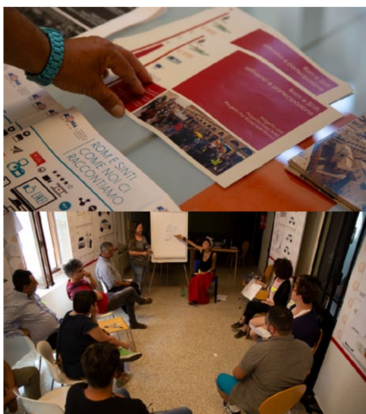
Bologna – local Sinti and Roma discuss their views on the main challenges to social inclusion and the lack of community spokespersons and mediators

'Key promoters' within the local communities, often due to their role or personality, have an important influence on the implementation and success of local activities. They can be key to motivating individuals to participate, to build trust in project implementers and project activities, and to boost the credibility of projects. When projects take into account such key promoters they can help to reach out to other community members and get them involved in local activities and projects.