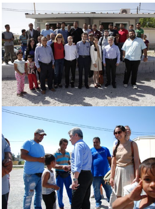
Megara – the mayor visits the Roma neighbourhood during a meeting to explain the research process and mobilise people to participate; outreach activities were often carried out within the neighbourhood

Measures to increase transparency in communication with respect to how actions are implemented and how decisions are taken is essential, in order to appropriately manage expectations and ensure that everyone has a shared understanding. Roles and responsibilities, and their limitations, should be carefully communicated to avoid the loss of trust following a possible failure to meet unrealistically high hopes in regards to project or policy outcomes.