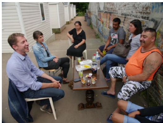
Lille – social workers from AFEJl participate in a meeting of the expression groups outside the homes of the Roma families. The expression groups allowed for Roma to vocalise their concerns, needs, and ideas

and realise that participation cannot be imposed by force.