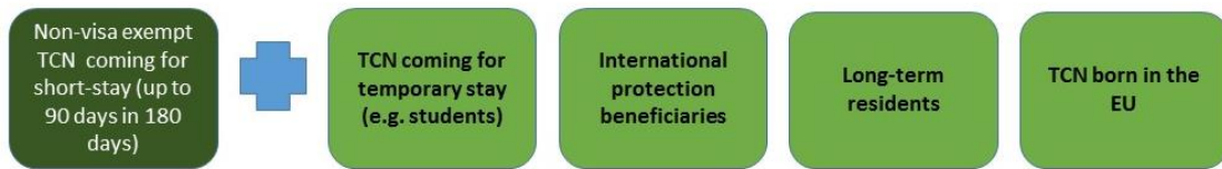
Figure 1: Categories of persons included in VIS

Notes: ■ Categories currently included in VIS