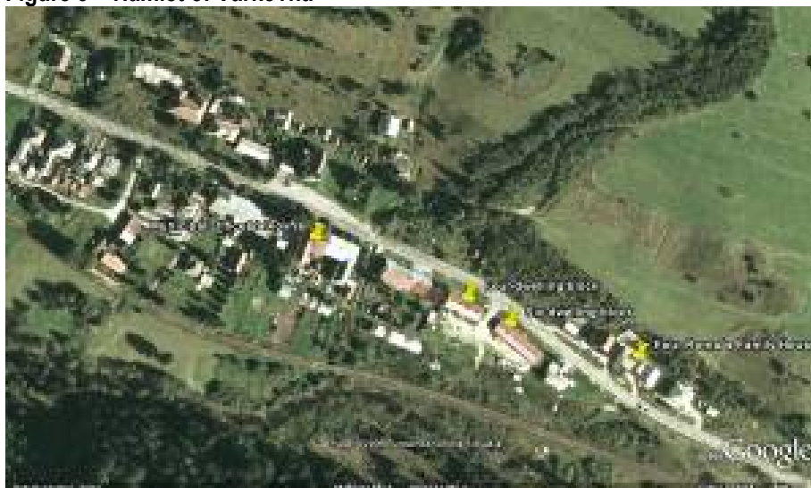
Figure 3 – Hamlet of Vaľkovňa