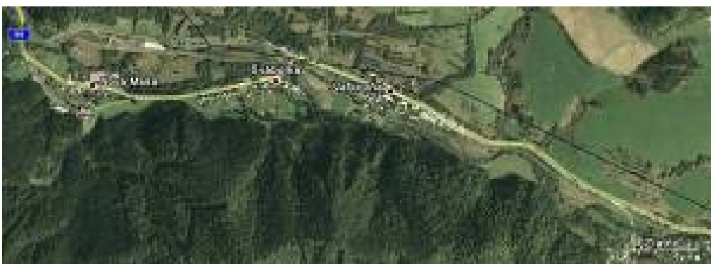
Figure 2 – Municipality of Vaľkovňa