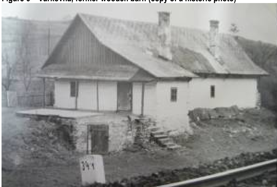
Figure 7 – Nálepково