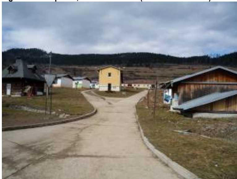
Figure 8 – Nálepkovo, settlement Grün (view from the road)