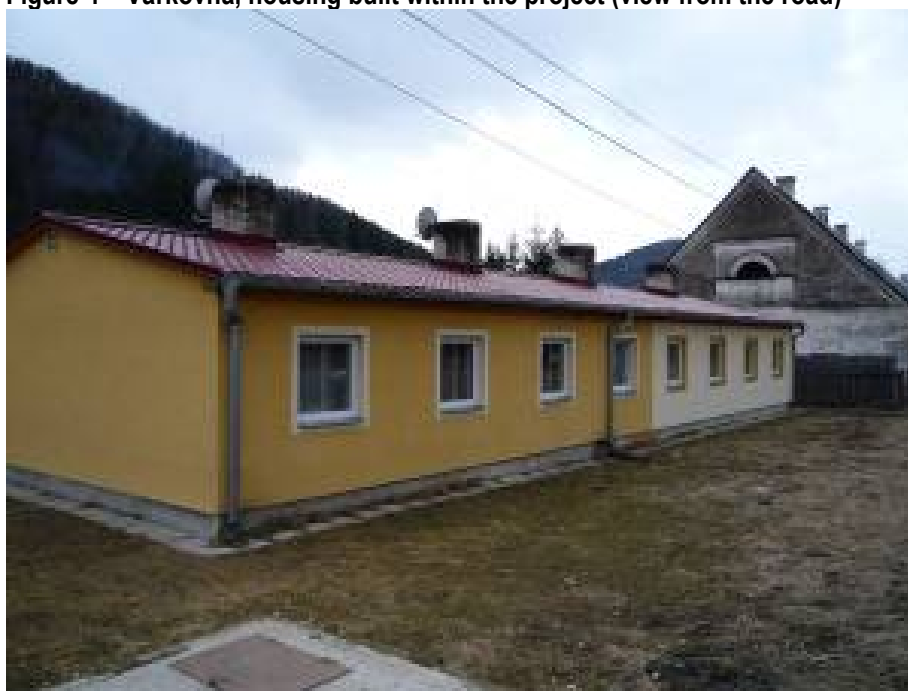
Figure 4 – Vaľkovňa, housing built within the project (view from the road)