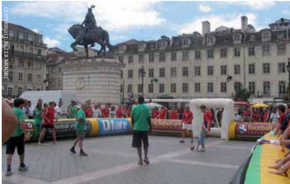
Football Unites Racism Divides (FURD), a local anti-racism NGO from Sheffield, took their Street Kick inflatable football pitch across to Portugal throughout the competition bringing together supporters from all the competing countries teams.

Following the 2004 Championship racist chanting and racist behaviour sadly still occurred in league games as well as internationals across parts of Europe. FARE and UEFA are working together to combat it but some national Football Associations seem to be in a state of self-denial trying to pretend that it isn't a problem in their country. But it is and when I attended a conference in Barcelona a couple of years ago and heard top people from the Spanish FA trying to dismiss the racist behaviour that takes place in Spain on a far too frequent basis I realised there is still a long way to go.