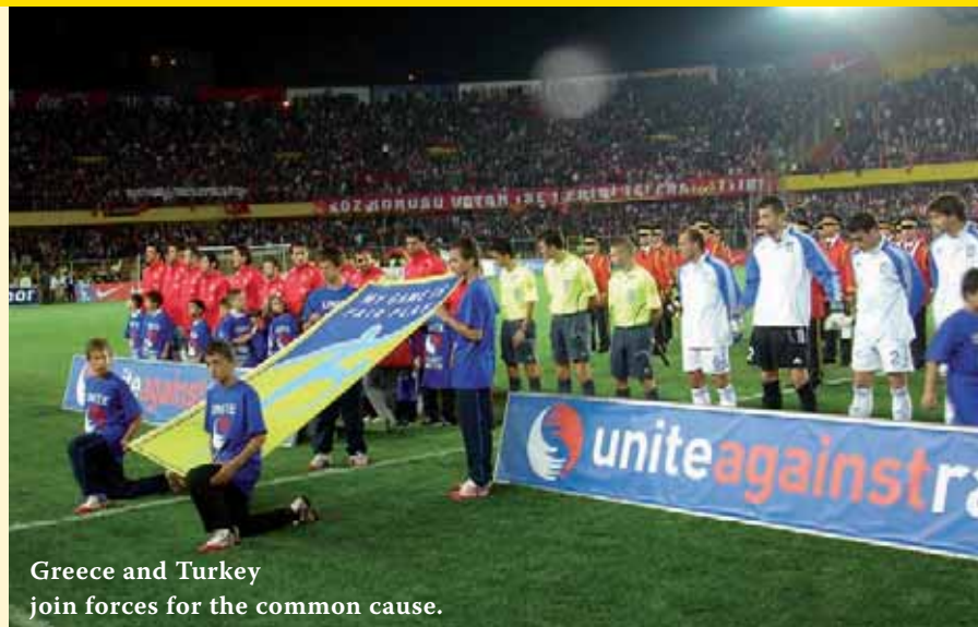
Greece and Turkey join forces for the common cause.

Well, I believe we can take a different road. The human and social values that underpin sport at all levels – from the grassroots to the professional elite – are not some luxurious afterthought that we can afford only as long as the economic machine continues to turn. Nor are they the preserve of amateur sport. No, those values are essential to sport's enduring popularity among millions of