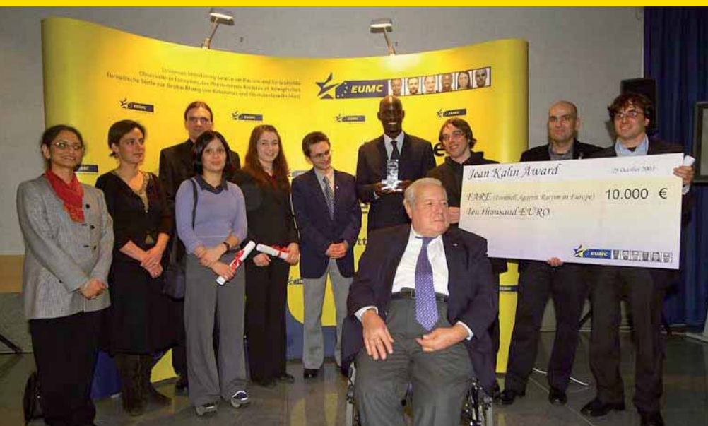
FARE receives Jean Kahn award from EUMC (predecessor of FRA).